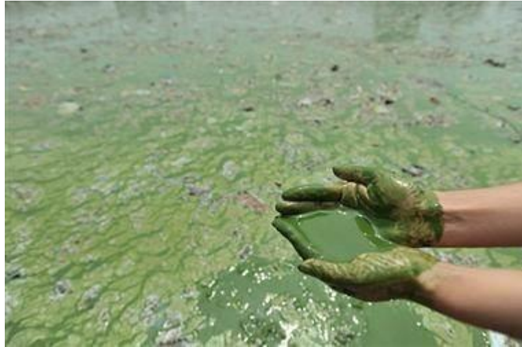
Figure 4. Eutrophication Indicator

Eutrophication is characterized by specific indicators that can help diagnose and assess the degree of nutrient enrichment and its effects on freshwater ponds. These indicators provide valuable information for monitoring and managing eutrophication. In this section, we explore key eutrophication indicators: