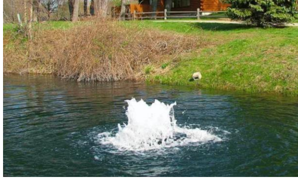
Figure 8. Aeration (Boilermaker aerator)

Aeration and water circulation are vital components of eutrophication management in freshwater ponds.