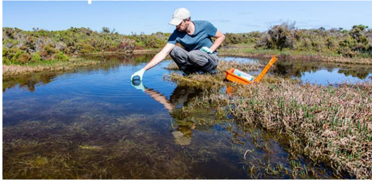
Figure 3. Pond Assessment

Conducting a comprehensive assessment of a freshwater pond is the crucial first step in understanding its current condition and identifying the extent of eutrophication. This section outlines the systematic process and key considerations involved in conducting a pond assessment.