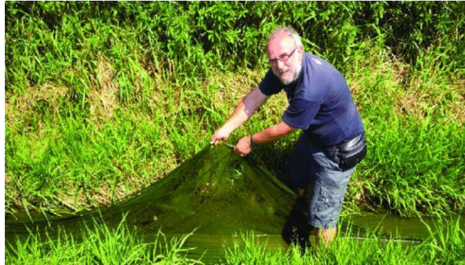
Figure 7. Algae control and management (Filamentous algae, a typical result of eutrophication. Břehovský Creek, South Bohemia)

Effective algae control and management are essential components of eutrophication mitigation in freshwater ponds. Algae, particularly harmful algal blooms (HABs), can disrupt ecosystems and impact water quality.