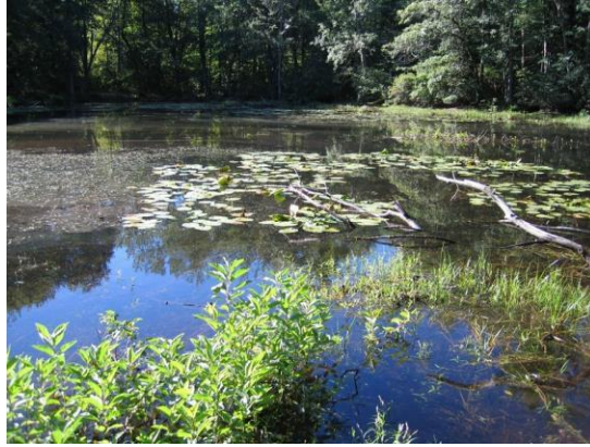
Figure 1. Eutrophication

Eutrophication is a complex ecological phenomenon that occurs in freshwater ecosystems, primarily in ponds, lakes, rivers, and reservoirs. It is characterized by an excessive accumulation of nutrients, mainly nitrogen and phosphorus, in the water, leading to profound changes in the aquatic environment.