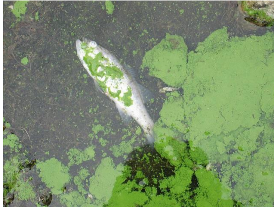
Figure 5. Nutrient management

Nutrient management is a key component of eutrophication mitigation in freshwater ponds. Controlling and reducing nutrient sources are essential steps to restore and maintain water quality.